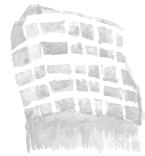
extra soft blanket